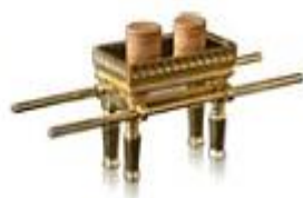
הַשֻּׁלְחָן לֶחֶם פָּנִים